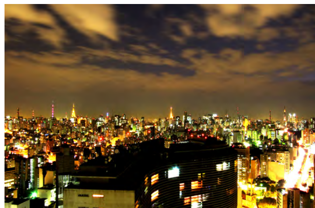
São Paulo – a city known for being continuous Congresses, trade fairs, conventions, international concerts