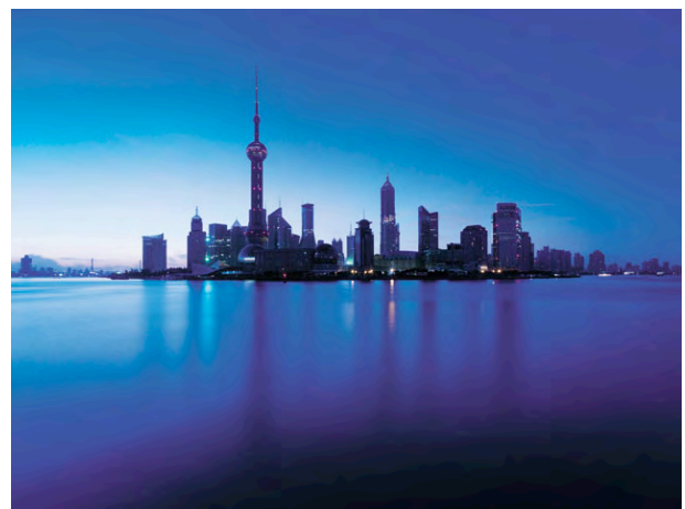
Pudong Shangri-La in Shanghai