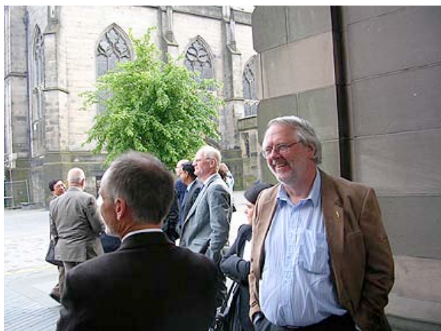
Delegates awaiting the commencement of the CIB W070 Civic Reception, Lothian Chambers

The conference included two weekend technical visits with the focus on heritage buildings in Scotland. The tours included tour commentaries by respected historians and heritage specialists. One visit examined the UNESCO World Heritage Site at New Lanark as well as Rosslyn Chapel (popularised by the Da Vinci Code).