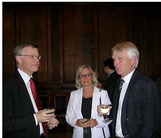
Delegates at the CIB W070 Civic Reception